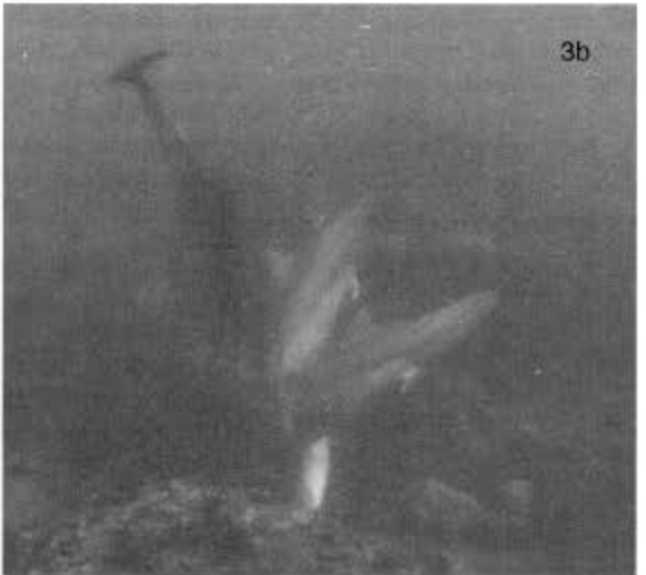
Figure 3. (a) The dead sub-adult male dolphin from observation no. 2 in \sim 6 m depth \sim 75 m from shore. He lies on a patch of black sand, ventral side up. (b) Sub-adult male attendant dolphins posturing at carcass with penile erections.

More than a dozen male dolphins milled over the carcass in tight formation (Table 2). Often a few dolphins seemed to place themselves between the camera, human swimmers, and the body. On several occasions, as a researcher (swimmer) approached the carcass within 2 m, one to three dolphins postured aggressively, intercepted the swimmer, and approached the camera, although aggressive behaviours were not directed at swimmer or camera (Table 2). The attending males 'postured' toward one another often 'kicking' their flukes at nearby conspecifics while vertically positioned over the carcass. During the first 17 min of observation (Part 1, Table 2), no penile erections were documented from any attending males; these males echolocated and head-scanned the carcass from its rostrum to the anterior