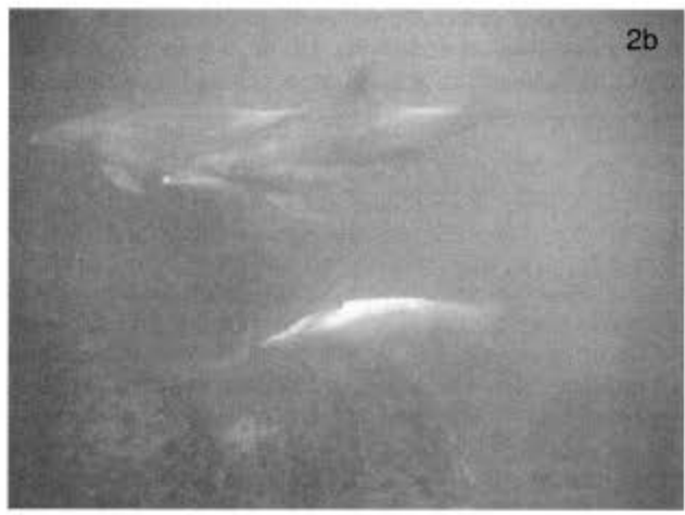
Figure 2. (a) The dead female bottlenose dolphin from observation no. 1 lies in \sim 8 m depth \sim 150 m from shore. She lies on black sand between large ( \sim 2-3 m) boulders. (b) Two adult males remained with the carcass from observation no. 1.